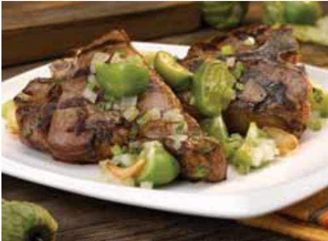
Grilled Loin Chops With Tomatillo Chutney