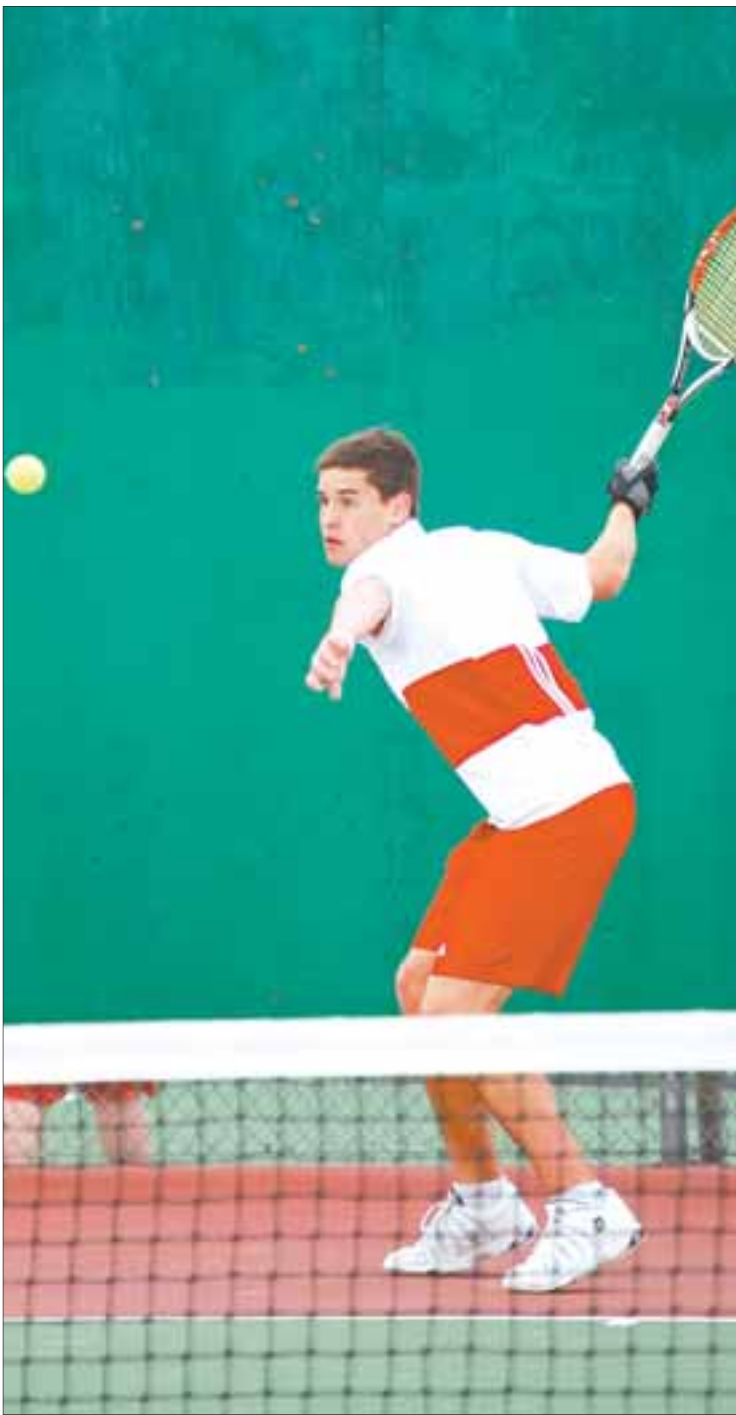
Sophomore keeps winning